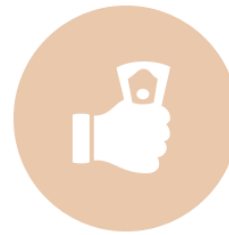
Surprise medical bills and other billing issues

Patients can also share their stories through the website.