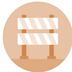
Step therapy, prior authorization and other barriers to care