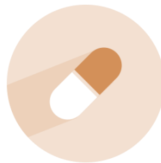
Barriers to prescription medicines