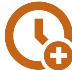
Delays in accessing care