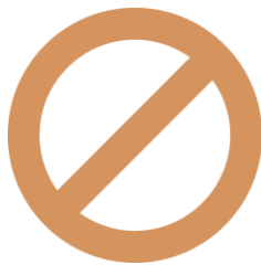
Denials to important procedures and/or specialists

Many patients either don't understand their health care treatment options or are subject to their health plan's barriers to care. My Patient Rights helps patients who experience: